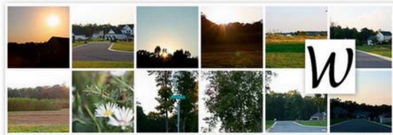
Woodfield Homeowners' Association

WELCOME CONTACT US DIRECTORY SUBSCRIBE Q&A HOME PAGE ARCHIVE RANDOM RSS SEARCH